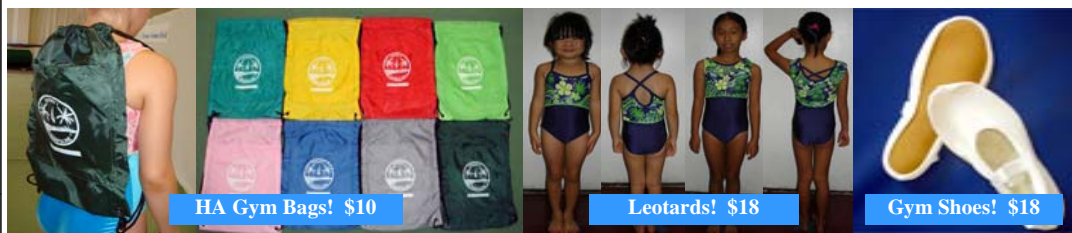
HA Gym Bags! $10