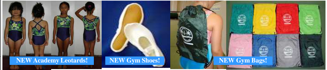
NEW Academy Leotards!